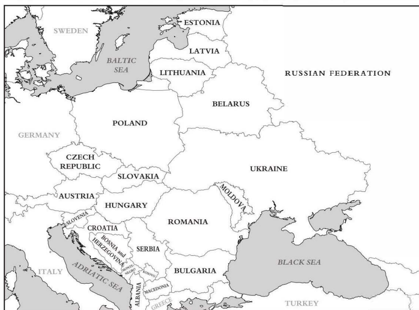
EASTERN EUROPE AFTER THE FALL OF COMMUNISM

End of the Cold War Sweeping agreements to dismantle their nuclear weapons were one piece of tangible proof that the Cold War had ended. Bush and Gorbachev signed the START I agreement in 1991, reducing the number of nuclear warheads to under 10,000 for each side. In late 1992, Bush and Yeltsin agreed to a START II treaty, which reduced the number of nuclear weapons to just over 3,000 each. The treaty also offered U.S. economic assistance to the troubled Russian economy.